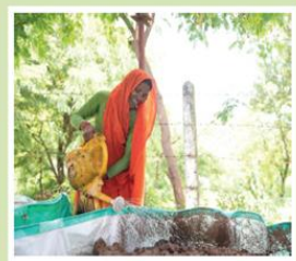
Bundelkhand with annual turnover of INR 20 Lakhs and 500 customer base, to nurture economic development and enhance livelihood security by strengthening local value chains

We are committed to work together to advocate transition to sustainable and inclusive futures and share lessons, ideas and experiences about Local Green Enterprises in India.