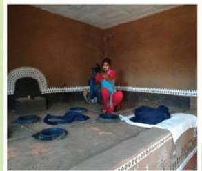
Sagara Natural Dye Cluster is an ecologically friendly cluster with 0% waste and 0 Carbon footprint and treat all the water use through Eco friendly technology. It is a community based model, operated mostly by all women.