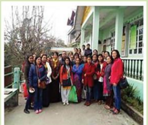
'Fidgety Fingers' is a social entrepreneurship venture based in Sikkim create and sell handicrafts (mostly woolen) through social media platforms in Sikkim and across India. They have built a network of women belonging to various necessitous backgrounds, training them on the skills of knitting and crocheting.