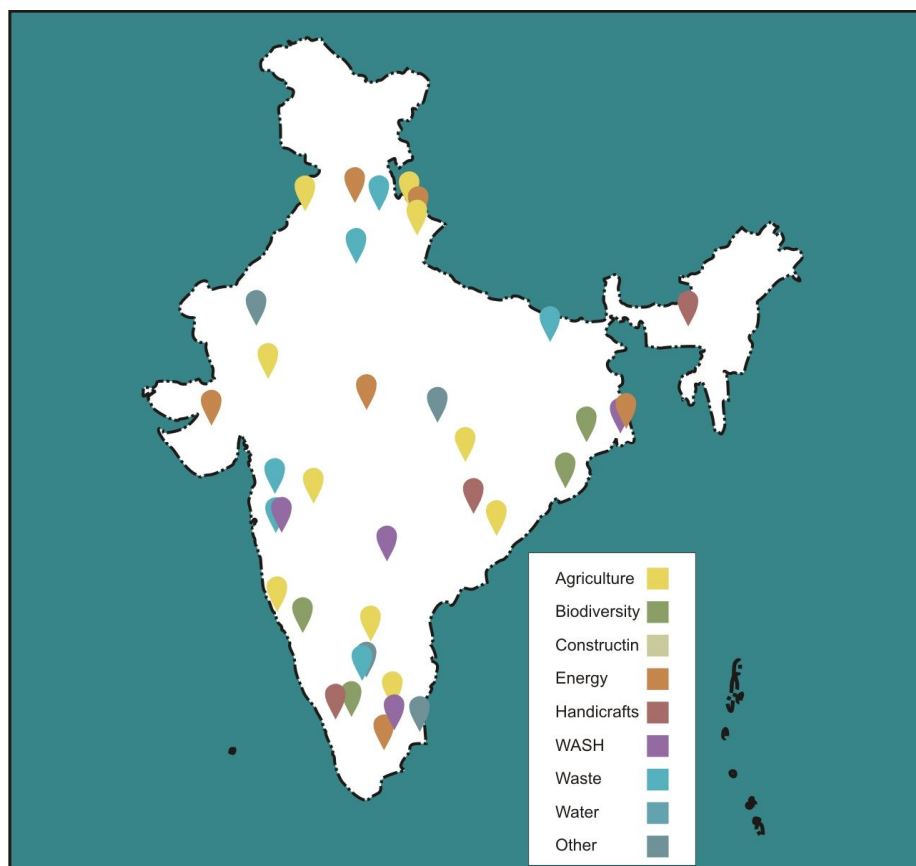
Figure 1: Map Showcasing Green Initiatives in India

The programme with five member organisations 1 identified and documented 150 green initiatives, on an online platform 'Mainstreaming Alternative Perspectives – South Asia' 2 (MAP-SA). The aim was to dovetail alternative ways that advocate for an environmentally sustainable and socially just approach for economic development. The initiatives documented serve as catalysts in the transition towards a new green economy by establishing the practice to policy connect. With the spread across various sectors like agriculture, biodiversity, construction, energy, WASH, and waste the aspiration to have sustainability incorporated in the development trajectory becomes stronger.